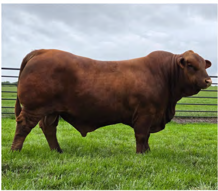
LOT 1A WPR POLLED WORLD CLASS