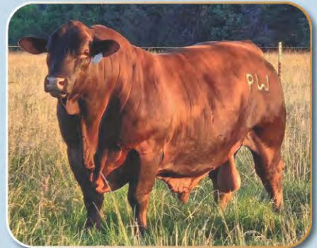
WPR Leading Edge C1138618

DVAuction.com (402) 316-5460 Must Pre-Register