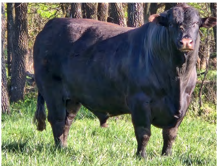
LOT 1C WPR CHANGE IT UP