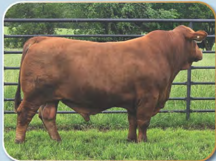
WPR Bringing Sexy Back C1167871

Service sire to some of the bred heifers in the sale