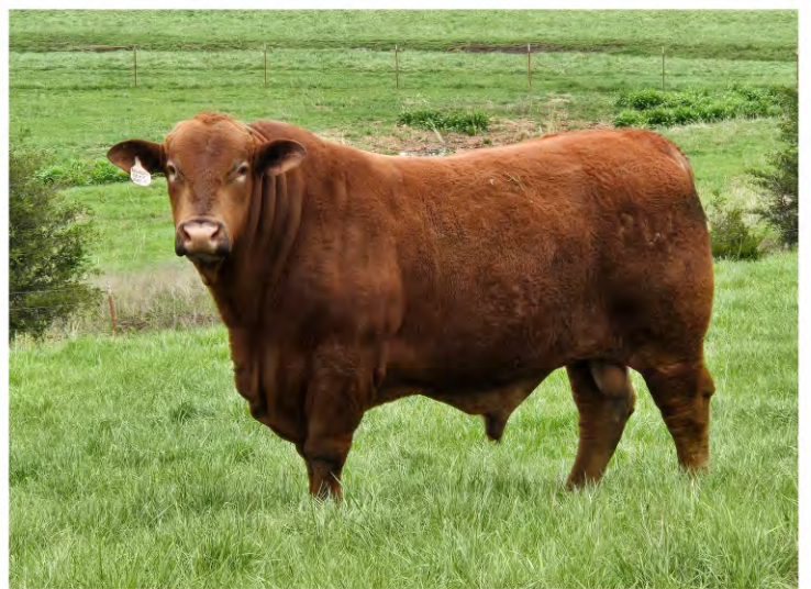
LOT 1D WPR BRINGING SEXY BACK