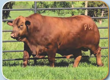
WPR World Class C1161474

Service sire to some of the bred heifers in the sale