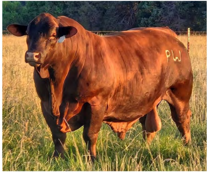
LOT 1B WPR POLLED LEADING EDGE