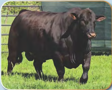
WPR Change It Up C1151125