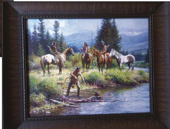
THE RIVER'S GIFT 11 x 14 Giclee in a 16 x 19 walnut veneer frame