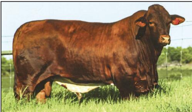
JT Prince 58 - Vision X Madam Secretary REA: 11.92; IMF: 3.01