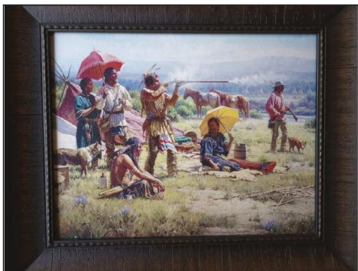
PARASOLS AND BLACK POWDER 11 x 14 Giclee in a 16 x 19 walnut veneer frame