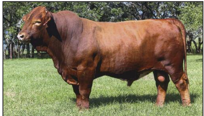
4C Impact 14/15 - The Legend 30/1 X 4C 980/7 (Classic Cotton x Miss Dusty 45/7) $T Index: 99.88; $M Index: 17.99.

Semen now available from Inspiration, Prince, and Impact and WB 113/1 SALE DAY for $50.00 per straw - collected and stored at Elgin Breeding Service. All semen purchased comes with A.I. certificates.