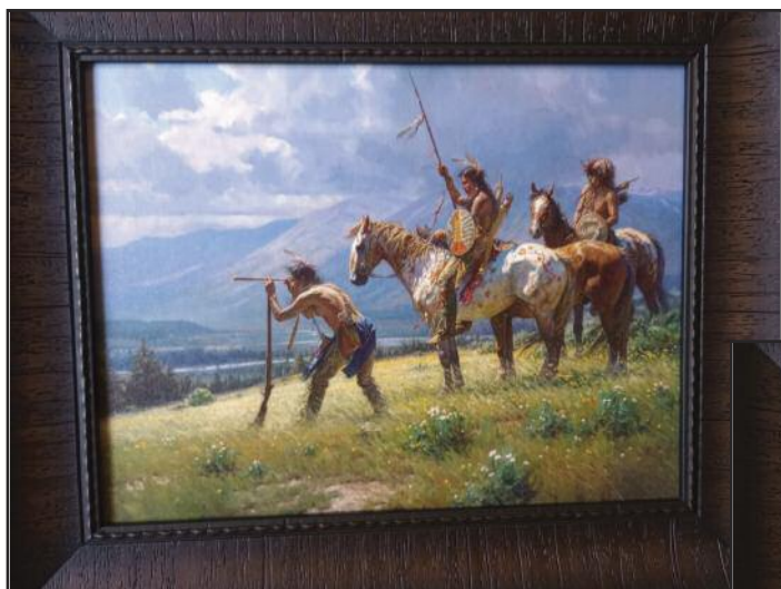
DUST IN THE DISTANCE 11 x 14 Giclee in a 16 x 19 walnut veneer frame

All pictures are framed and ready to hang.