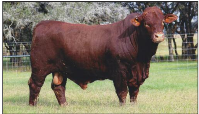
WB Solutions Big Boy WB - ID #113/1 (Solution son)

(A Bentley son, being a Summit and Destiny grandson) Pictured at 17 1/2 months old - Classified U 1/2 Inspiration is the only Beefmaster bull that we currently know of that at official yearling scanning had BOTH an REA over 15 and an IMF over 5. $T Index: 122.79; $M Index: 23.16