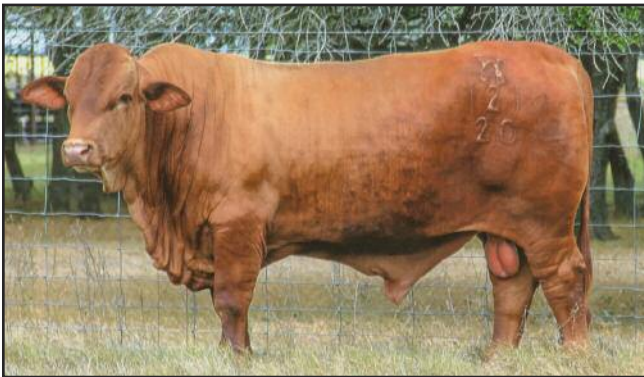
SWB Inspiration - ID #121/20

Four of our young herd sires that are bred to and/or the sire of some of our sale heifers are pictured on this page.