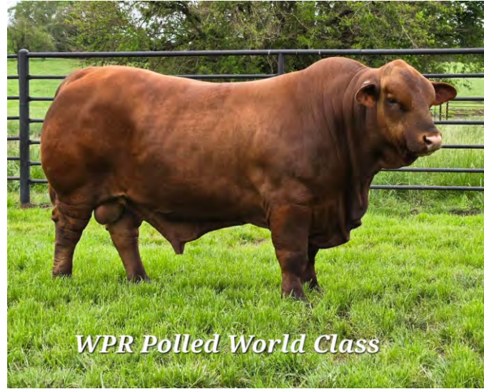
WPR Polled World Class

Lockwood, Missouri ▪ wallenprairieranch.com