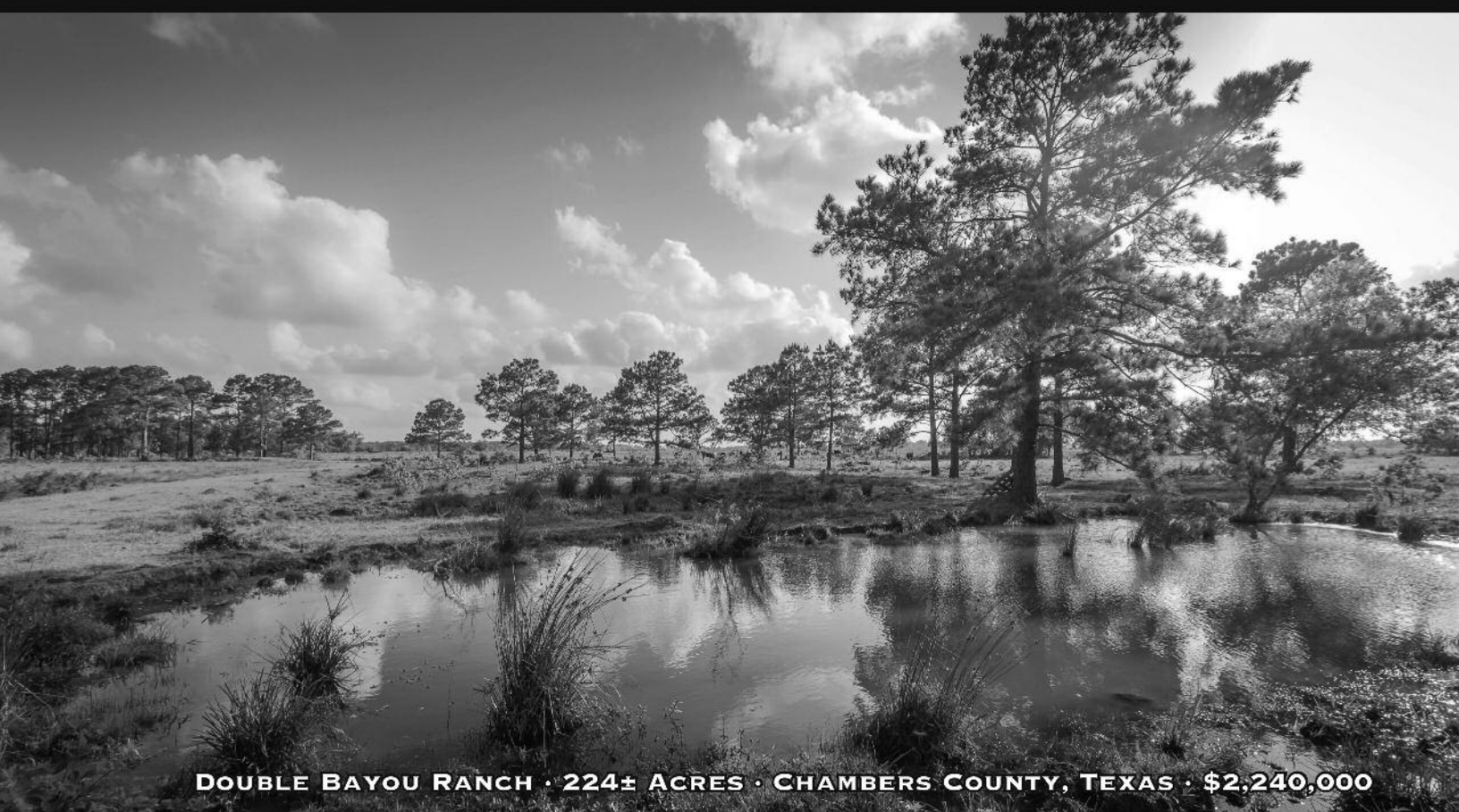
DOUBLE BAYOU RANCH • 224± ACRES • CHAMBERS COUNTY, TEXAS • $2,240,000