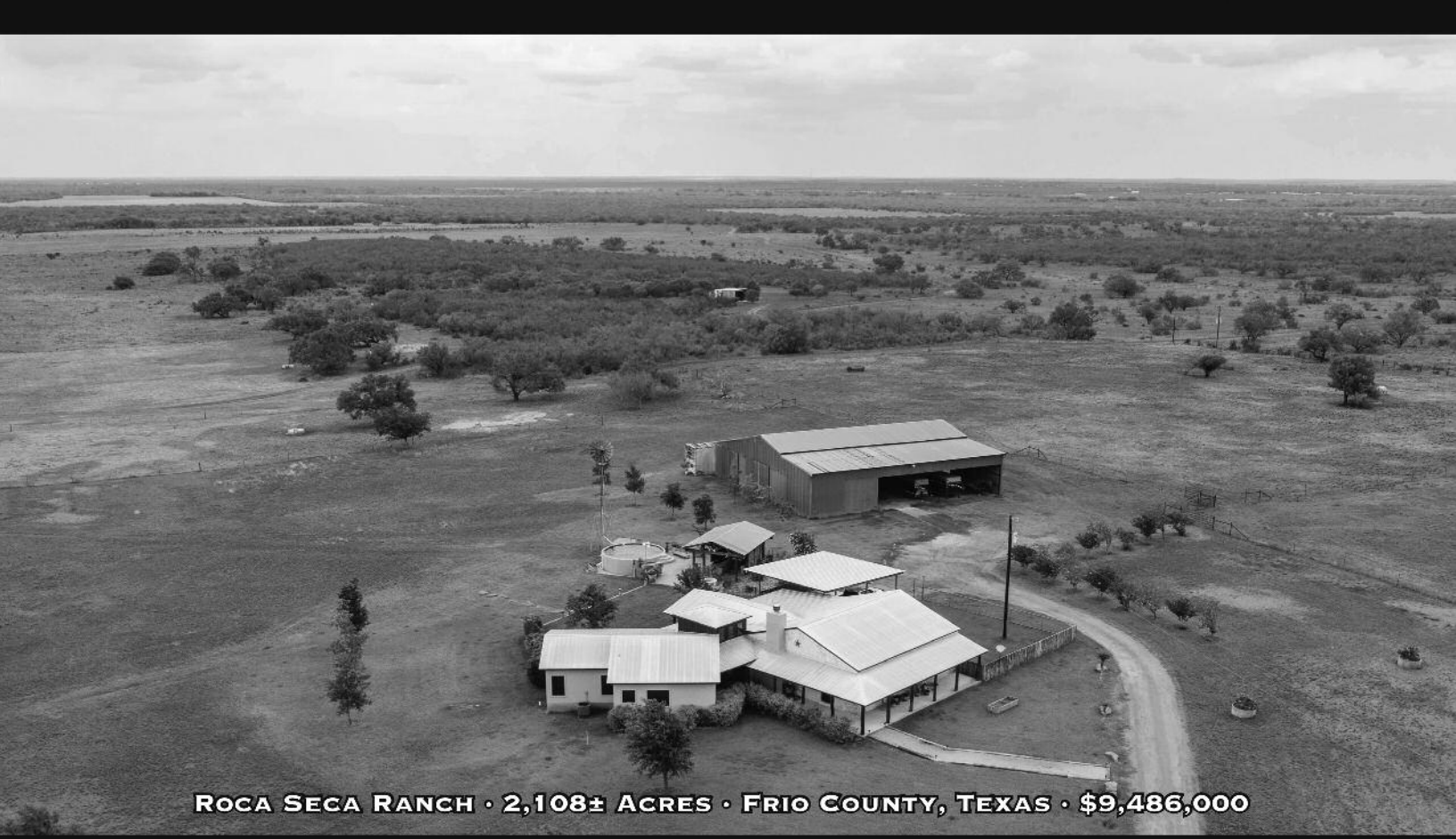
ROCA SECA RANCH • 2,108± ACRES • FRIO COUNTY, TEXAS • $9,486,000