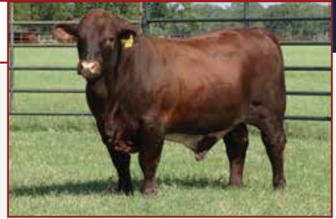
CF Cortez 374/5 Sire of Lot 46