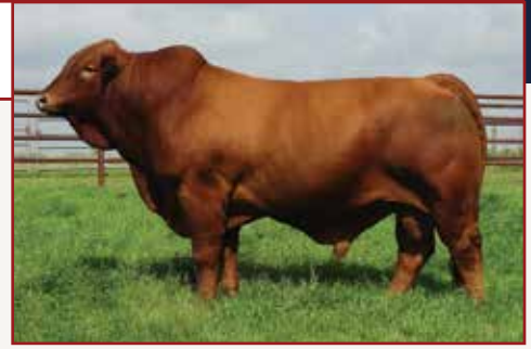
CF Troubador 879/3 Sire of Lot 58

NEW DIMENSION 805 V - SEVEN 501 CF TROUBADOR 879/3 V - SEVEN 1673 *CF RAQUEL 933/9 **LOGAN 62M27 JUNGLE WHISPER 49/1 CF DREAM CATCHER 914 **L2 CAPTAIN SUGAR 12/02 **OASIS 655 COLLIER FARMS CF 752/6 **LOGAN 62M27 **LOGAN'S BENGAL BABY 134/0 **BENGAL BABY 93/05