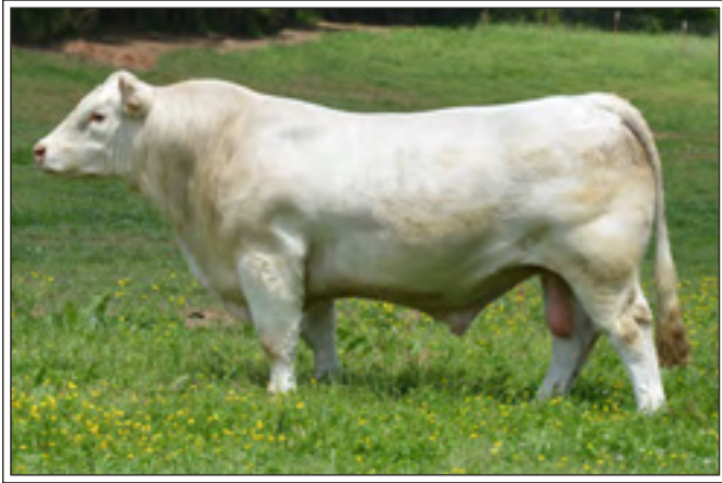
• JDJ MAXIMO A18 P • GRANDSIRE OF LOTS 238-243