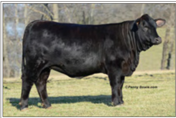
• ROCKIN PANDA • DAM OF LOT 14