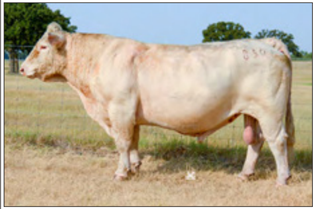
• M&M STEALTH 8501 ET • INFLUENCE IN LOTS 265-277