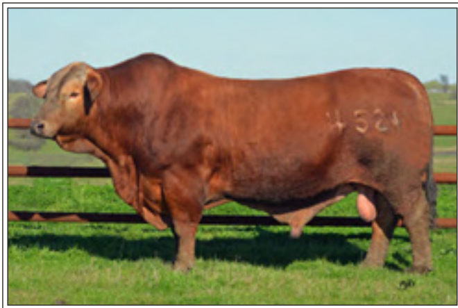
• MCALESTER • SIRE OF LOTS 21-28, 33