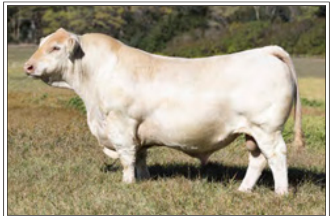
• ACE-ORR LOCK N LOAD 243P • SIRE OF LOTS 225-231