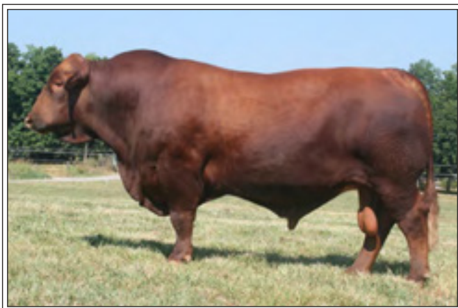
• CHRK GENESIS 1500T • INFLUENCE IN LOTS 86-97