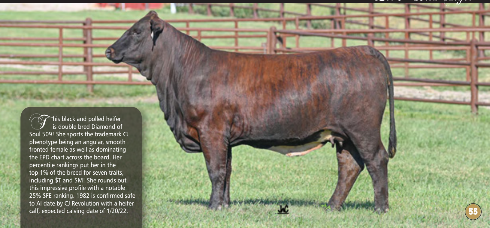
Lot 5 Bred Heifer

T his black and polled heifer is double bred Diamond of Soul 509! She sports the trademark CJ phenotype being an angular, smooth fronted female as well as dominating the EPD chart across the board. Her percentile rankings put her in the top 1% of the breed for seven traits, including $T and $M! She rounds out this impressive profile with a notable 25% $FE ranking. 1982 is confirmed safe to AI date by CJ Revolution with a heifer calf, expected calving date of 1/20/22.