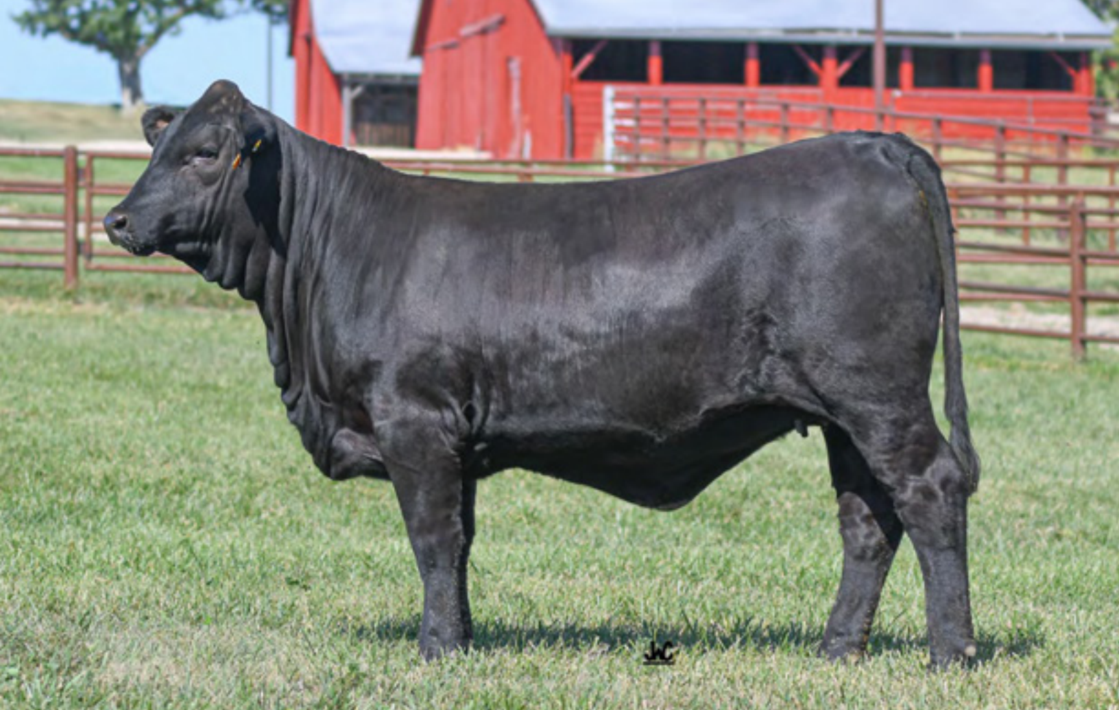
Lot 14 Open Heifer