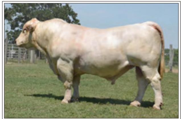
• RIO COLONEL B133 •