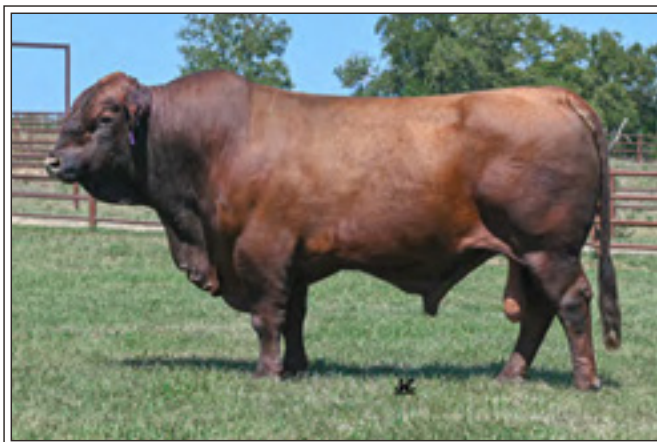
• HOOD RED RESERVE • SIRE OF LOTS 43-50