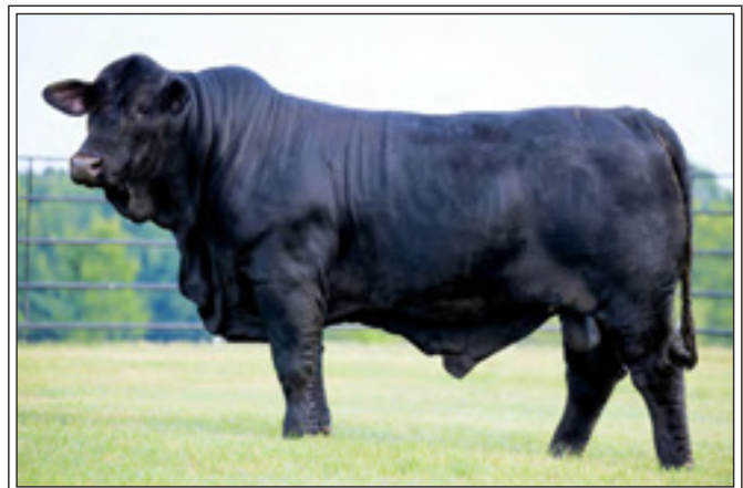
• CJ'S LOVE MAKER • SIRE OF LOTS 58-68