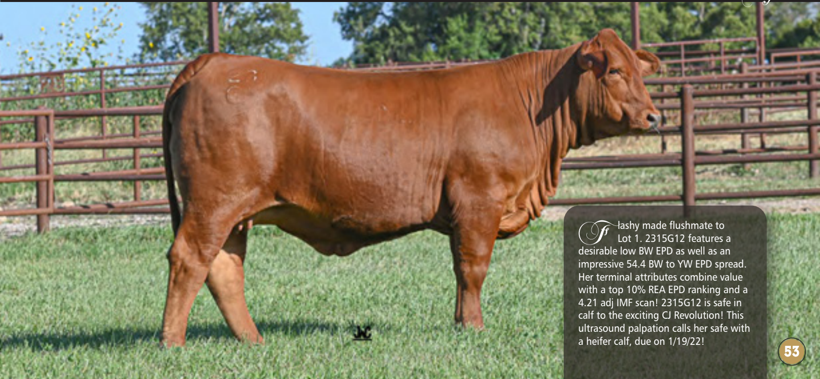
Lot 1B Bred Heifer

F lashed made flushmate to Lot 1. 2315G12 features a desirable low BW EPD as well as an impressive 54.4 BW to YW EPD spread. Her terminal attributes combine value with a top 10% REA EPD ranking and a 4.21 adj IMF scan! 2315G12 is safe in calf to the exciting CJ Revolution! This ultrasound palpation calls her safe with a heifer calf, due on 1/19/22!