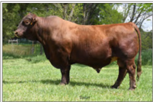
• MR CJ'S FIREBALL • SIRE OF LOT 14