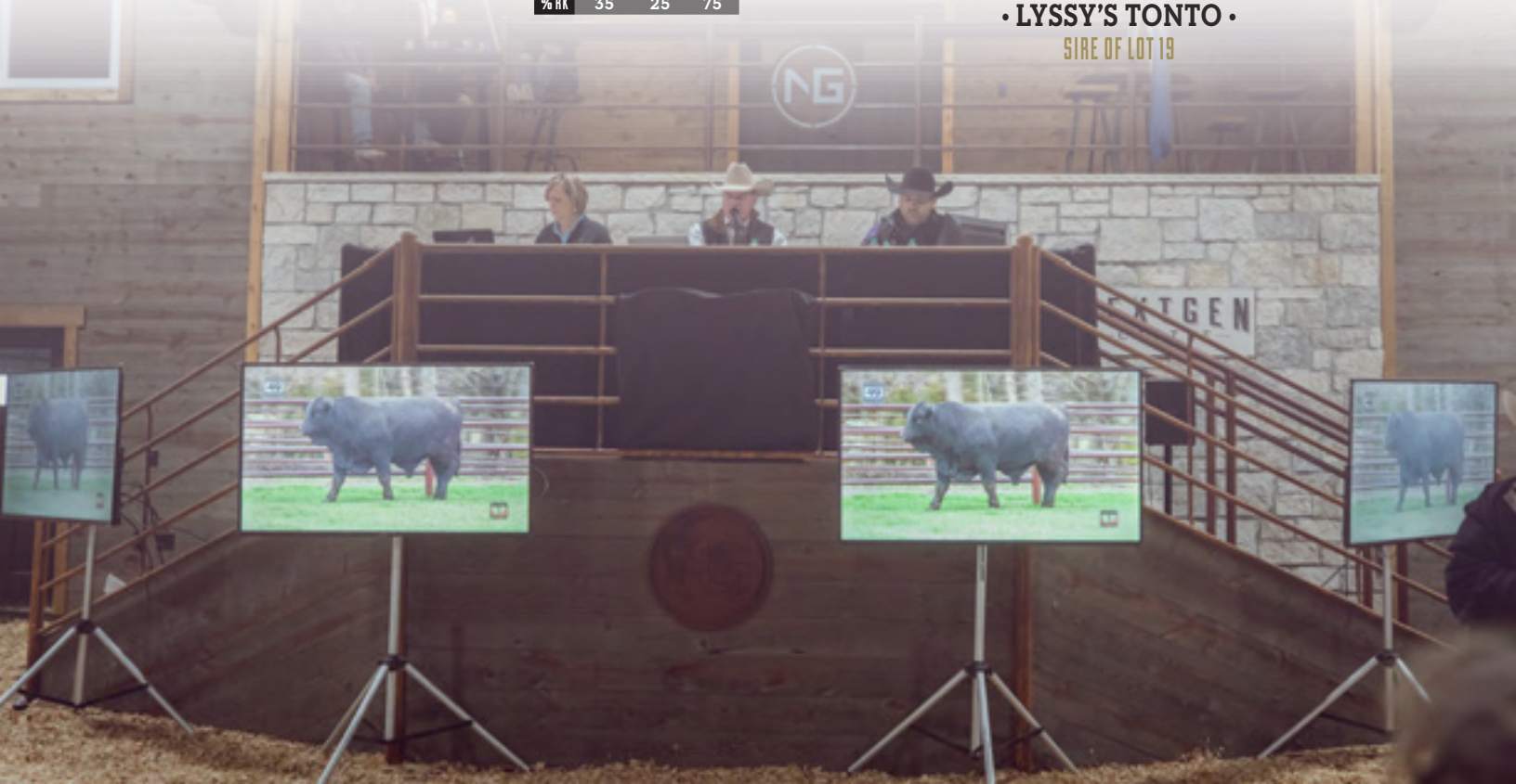
• LYSSY'S TONTO • SIRE OF LOT 19