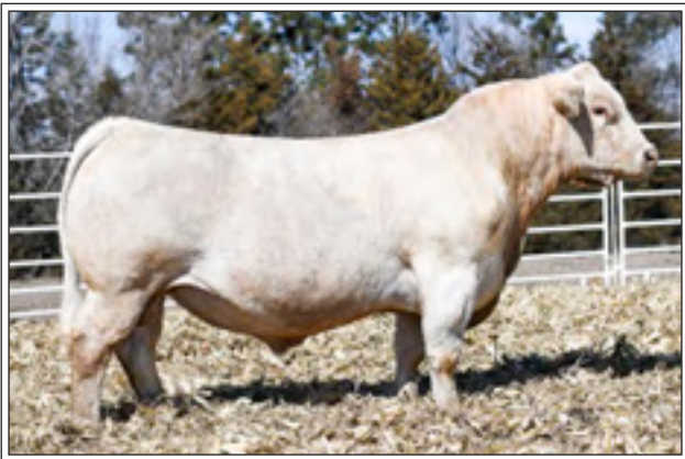
• CCC WC RESOURCE 417 P • SIRE OF LOTS 258-260